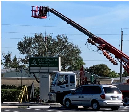
The old sign being removed.