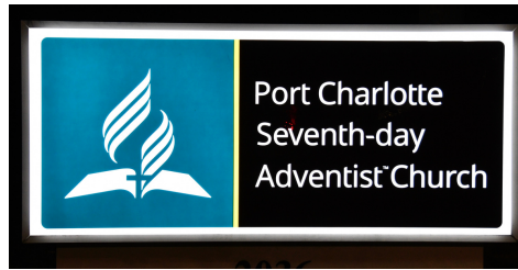
The new sign at Loveland Blvd.

The church sign at Kings Highway welcomes new people at the start of our new year! These are two of several messages being displayed on our electronic sign.